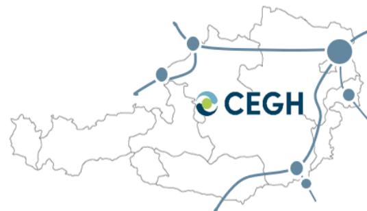
CEGH Virtual Trading Point (Start: 01/01/2013)